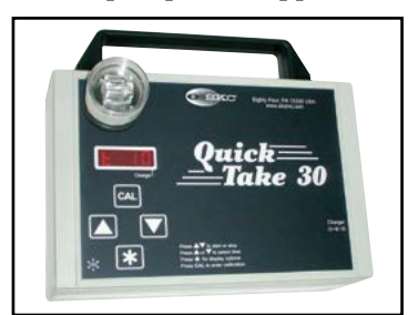
VersaTrap Cassette mounted on QuickTake 30 Sample Pump

features and accessories most needed for bioaerosol screening. The highly versatile QuickTake 30 sample pump can also be used with wall samplers, standard filter cassettes, impactors, and remote media. A programmable timer allows unattended sampling.